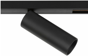
BLACK RAL 9005

The updated Vorsa Track 40 is a versatile mini "click and fit" track-mounted directional spotlight. It has been re-engineered for 2024 with a cleaner aesthetic, an increased light output and an industry-leading light output at 98 CRI. Interchangeable optics allow for a range of beam distributions, all easy to fit on-site. Its track architecture facilitates easy changing between different size Vorsa heads when commissioning a scheme. We have introduced a new innovative screwless self-supporting tilt mechanism. This fitting is ideal for use in areas of key areas of the home and is perfect for use on beams and concrete ceilings where recessed fittings are unsuitable. The Vorsa Track 40 can be used on a range of Stucchi track systems including recessed, surface mounted and suspended. Please ask for full details. The range has been built to the principles of the circular economy to not only maximise resources but also to reduce waste and environmental impact.