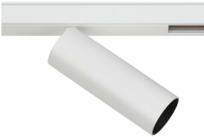
BLACK RAL 9005

The updated Vorsa Track 40 is a versatile mini "click and fit" track-mounted directional spotlight. It has been re-engineered for 2024 with a cleaner aesthetic, an increased light output and an industry-leading light output at 98 CRI. Interchangeable optics allow for a range of beam distributions, all easy to fit on-site. Its track architecture facilitates easy changing between different size Vorsa heads when commissioning a scheme. We have introduced a new innovative screwless self-supporting tilt mechanism. This fitting is ideal for use in areas of key areas of the home and is perfect for use on beams and concrete ceilings where recessed fittings are unsuitable. The Vorsa Track 40 can be used on a range of Stucchi track systems including recessed, surface mounted and suspended. Please ask for full details. The range has been built to the principles of the circular economy to not only maximise resources but also to reduce waste and environmental impact.