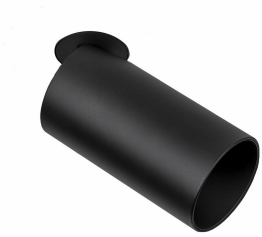
BLACK RAL 9005

The new Vorsa Port 50 spotlight has been re-imagined as a simplified plaster-in spotlight. It has been re-engineered for 2024 with a cleaner aesthetic, an increased light output and an industry-leading light output at 98 CRI. Interchangeable optics allow for a range of beam distributions, all easy to fit on-site. We have introduced a new innovative screwless self-supporting tilt mechanism. It comes complete with recyclable cardboard protection shield for first fix installation. The range has been built to the principles of the circular economy to not only maximise resources but also to reduce waste and environmental impact.