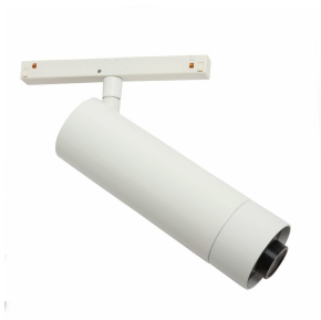
WHITE RAL 9910

TRACK MOUNTED FRAMING PROJECTOR TO PRECISELY LIGHT ART The award-winning Vorsa Frame 60 plaster-in is the trimless version of the Vorsa Frame to be used to light exceptional art. This luminaire uses multiple precision optical lenses to precisely illuminate artwork or an object by framing it perfectly with light, whatever its shape. It uses state-of-the-art LEDs which are designed specifically to replicate the human perception of colour. John Cullen will work with you through the careful planning stages and bespoke commissioning for each luminaire. This is required to exactly fit the artwork or object it is illuminating. Please note that projects outside of London may incur an additional cost to set up the Vorsa frame. Please discuss with sales for further information.