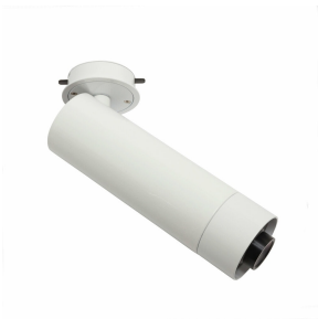
WHITE RAL 9910

FRAMING PROJECTOR, WITH MICRO-BEZEL, TO PRECISELY LIGHT ART The award-winning Vorsa Frame 60 plaster-in is the trimless version of the Vorsa Frame to be used to light exceptional art. This luminaire uses multiple precision optical lenses to precisely illuminate artwork or an object by framing it perfectly with light, whatever its shape. It uses state-of-the-art LEDs which are designed specifically to replicate the human perception of colour. John Cullen will work with you through the careful planning stages and bespoke commissioning for each luminaire. This is required to exactly fit the artwork or object it is illuminating. Please note that projects outside of London may incur an additional cost to set up the Vorsa frame. Please discuss with sales for further information.