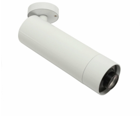
WHITE RAL 9910

SURFACE MOUNTED FRAMING PROJECTOR TO PRECISELY LIGHT ART The award-winning Vorsa Frame 60 plaster-in is the trimless version of the Vorsa Frame to be used to light exceptional art. This luminaire uses multiple precision optical lenses to precisely illuminate artwork or an object by framing it perfectly with light, whatever its shape. It uses state-of-the-art LEDs which are designed specifically to replicate the human perception of colour. John Cullen will work with you through the careful planning stages and bespoke commissioning for each luminaire. This is required to exactly fit the artwork or object it is illuminating. Please note that projects outside of London may incur an additional cost to set up the Vorsa frame. Please discuss with sales for further information.