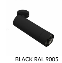
BLACK RAL 9005

The award-winning Vorsa Frame 60 plaster-in is the trimless version of the Vorsa Frame to be used to light exceptional art. This luminaire uses multiple precision optical lenses to precisely illuminate artwork or an object by framing it perfectly with light, whatever its shape. It uses state-of-the-art LEDs which are designed specifically to replicate the human perception of colour. John Cullen will work with you through the careful planning stages and bespoke commissioning for each luminaire. This is required to exactly fit the artwork or object it is illuminating. Please note that projects outside of London may incur an additional cost to set up the Vorsa frame. Please discuss with sales for further information.