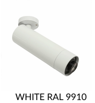
WHITE RAL 9910