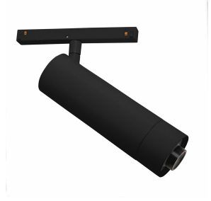
BLACK RAL 9005