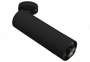
BLACK RAL 9005

SURFACE MOUNTED FRAMING PROJECTOR TO PRECISELY LIGHT ART The award-winning Vorsa Frame 60 plaster-in is the trimless version of the Vorsa Frame to be used to light exceptional art. This luminaire uses multiple precision optical lenses to precisely illuminate artwork or an object by framing it perfectly with light, whatever its shape. It uses state-of-the-art LEDs which are designed specifically to replicate the human perception of colour. John Cullen will work with you through the careful planning stages and bespoke commissioning for each luminaire. This is required to exactly fit the artwork or object it is illuminating. Please note that projects outside of London may incur an additional cost to set up the Vorsa frame. Please discuss with sales for further information.